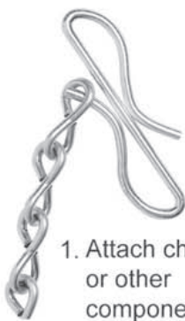
1. Attach chain or other component.