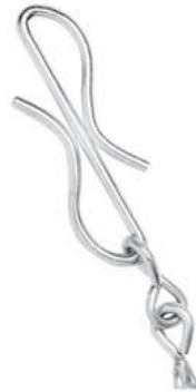
2. Snap into place! Stays