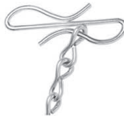
3. Snap out to remove.