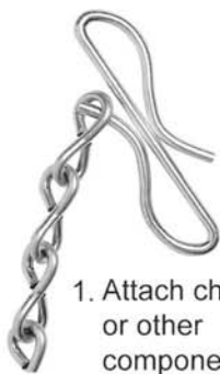
1. Attach chain or other component.