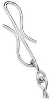
2. Snap into place! Stays