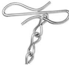
3. Snap out to remove.